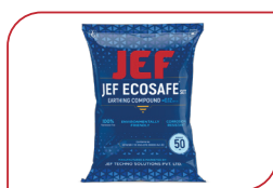
JEF Eco Safe Set

Complete range of type-tested LPS components as per IEC 62561(62305). Sequentially type tested for aging, (10/350 \mu s) 100kA lightning impulse, mechanical test.